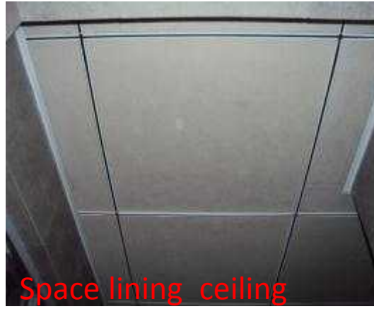
Space lining ceiling