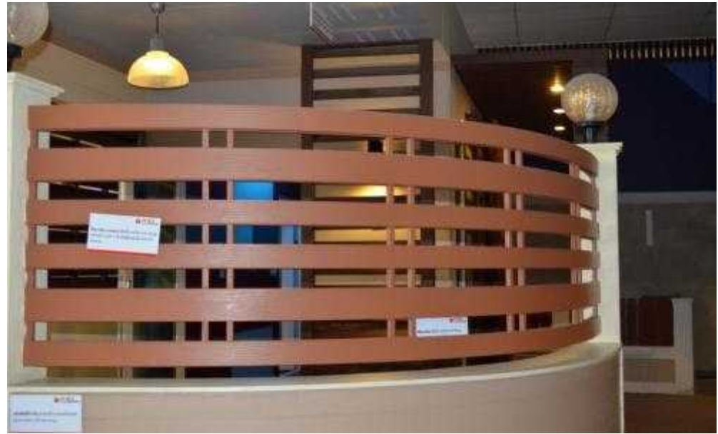
SCG Smartwood: Fencing application