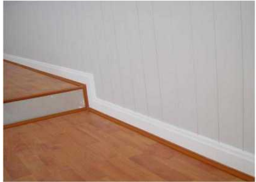
SCG Smartwood: Skirting application