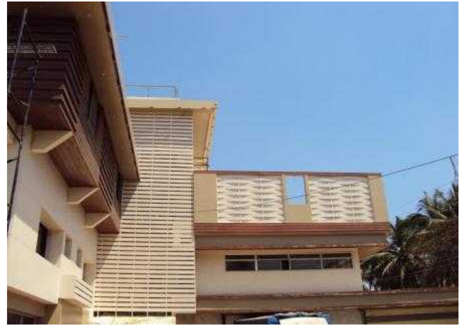
SCG Smartwood: Screen wall application