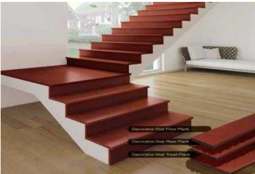
SCG Smartwood: Stair planks application