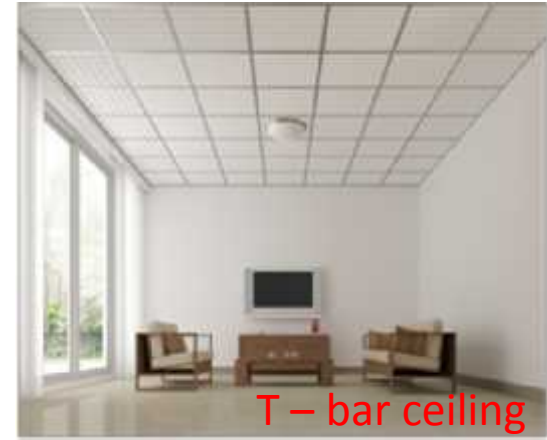
T - bar ceiling